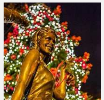
Bewitched Statue.

Serving meals at 11:15 A.M. *Cape Ann residents who are homebound and would like to have a meal delivered may call by 1 P.M. on 12/23