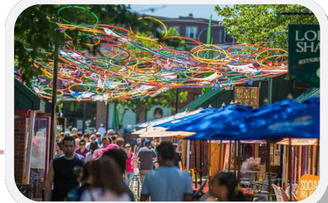
Artists' Row.

and potential public art opportunities throughout the community. Several of the Master Plan's components are detailed below.