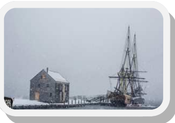
Old Town Hall.

Friendship.