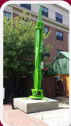
Public art installation at Artists' Row.