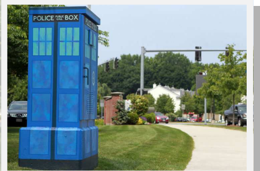
Salem ArtBox, turning City-owned utility boxes into original works of art.