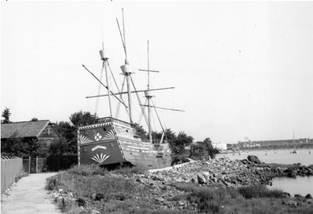
Figure 2. Ruck House (left) and Arbella (right), July 1949.