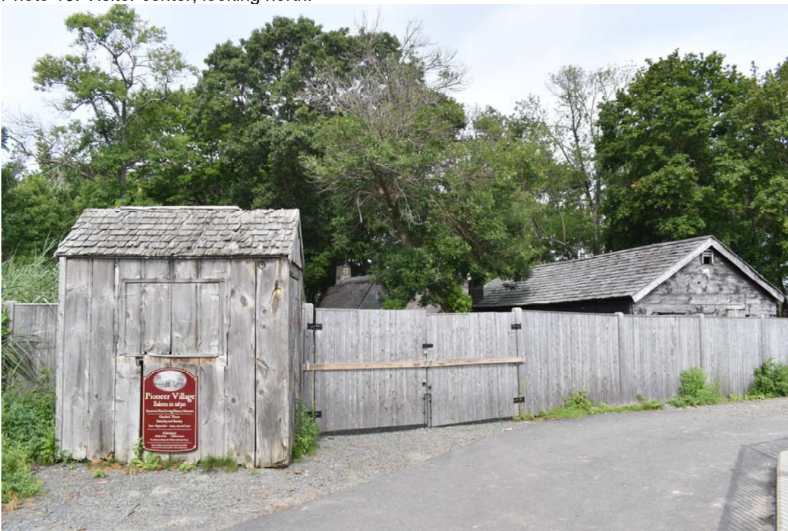
Photo 11. Ticket Booth and palisade fence, looking northwest.