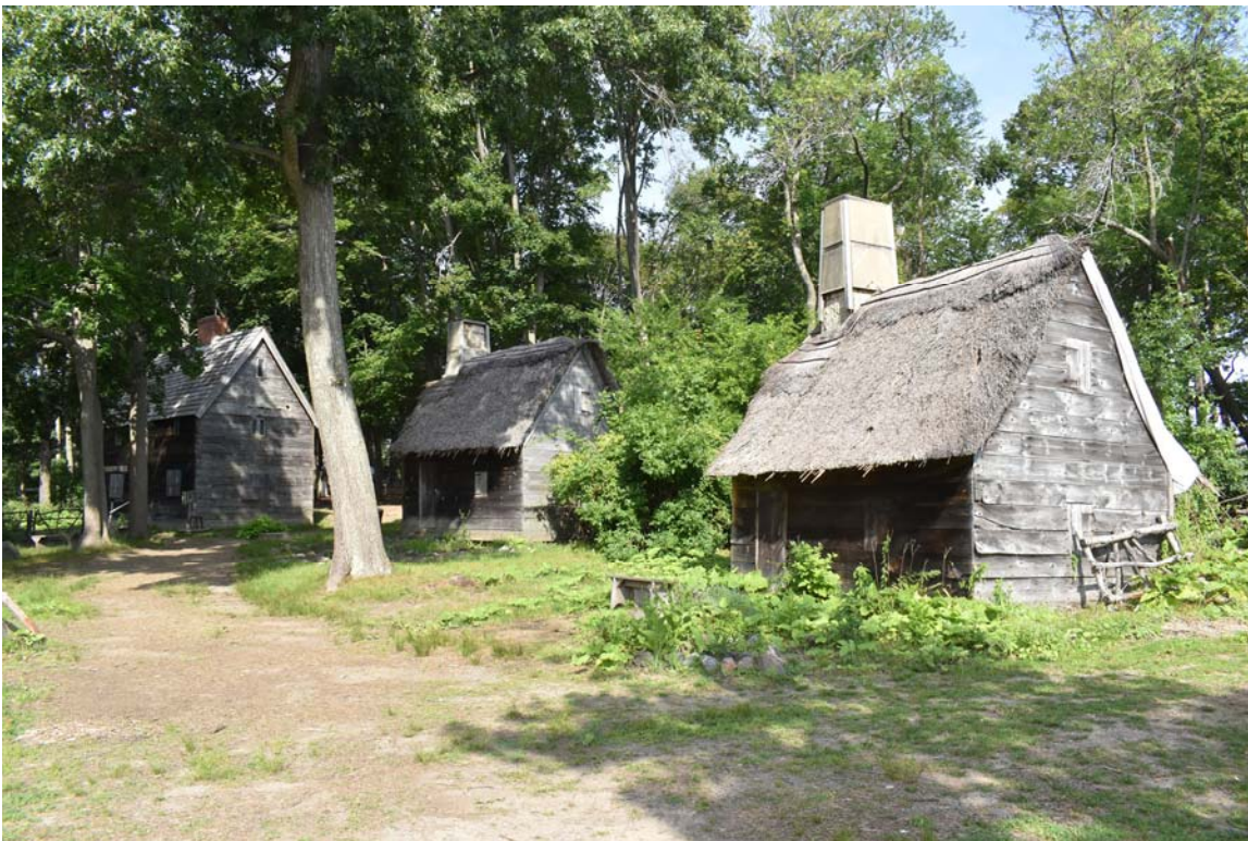
Photo 8. (L to R) Governor's Fayre House, Blacksmith Cottage, Arbella Cottage, looking northwest.