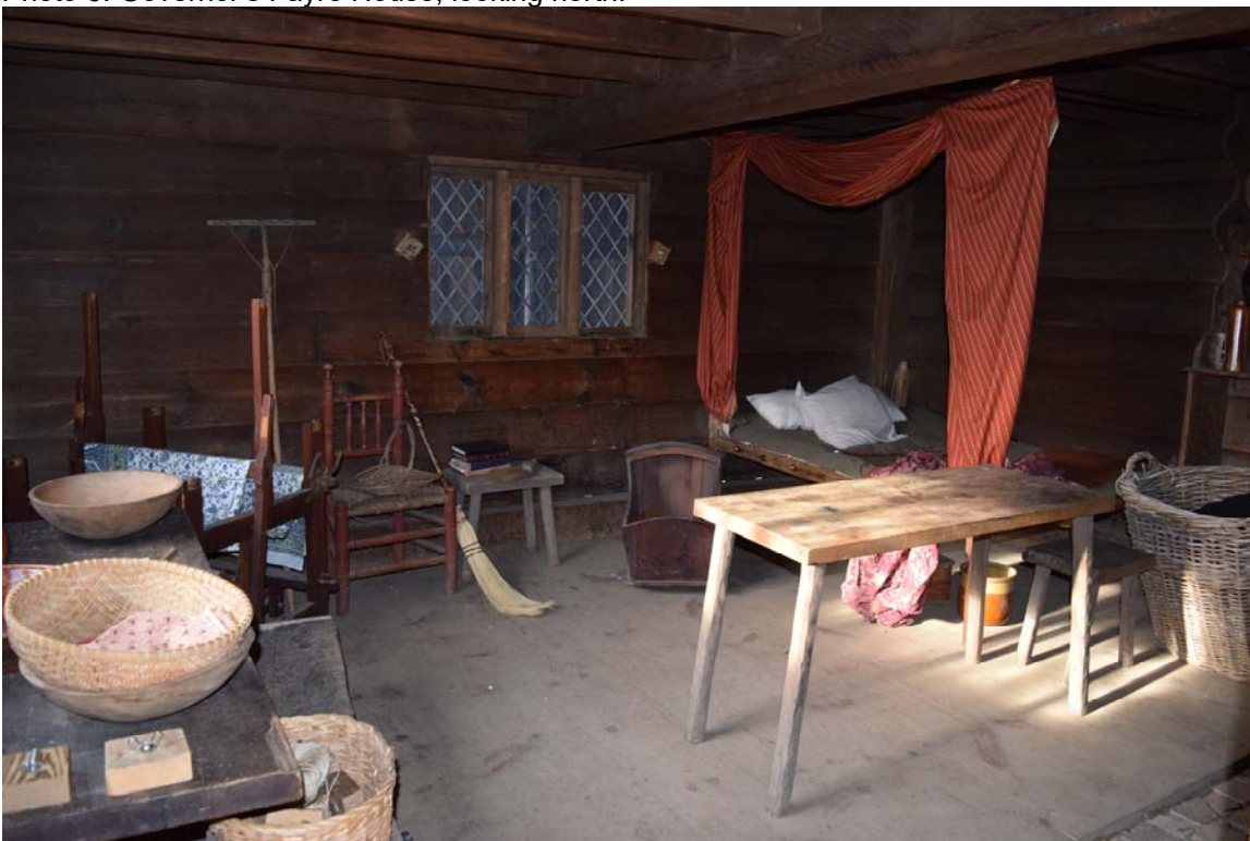
Photo 7. Interior, Governor's Fayre House, looking northwest.