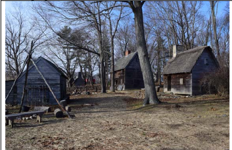
Photo 1. (L to R) Blacksmith shop, Governor's Fayre House, and Blacksmith Cottage, looking northwest.