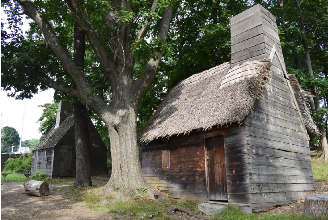
Photo 2. (L to R) Admission and Gift Shop and Woodbury cottage, looking west.