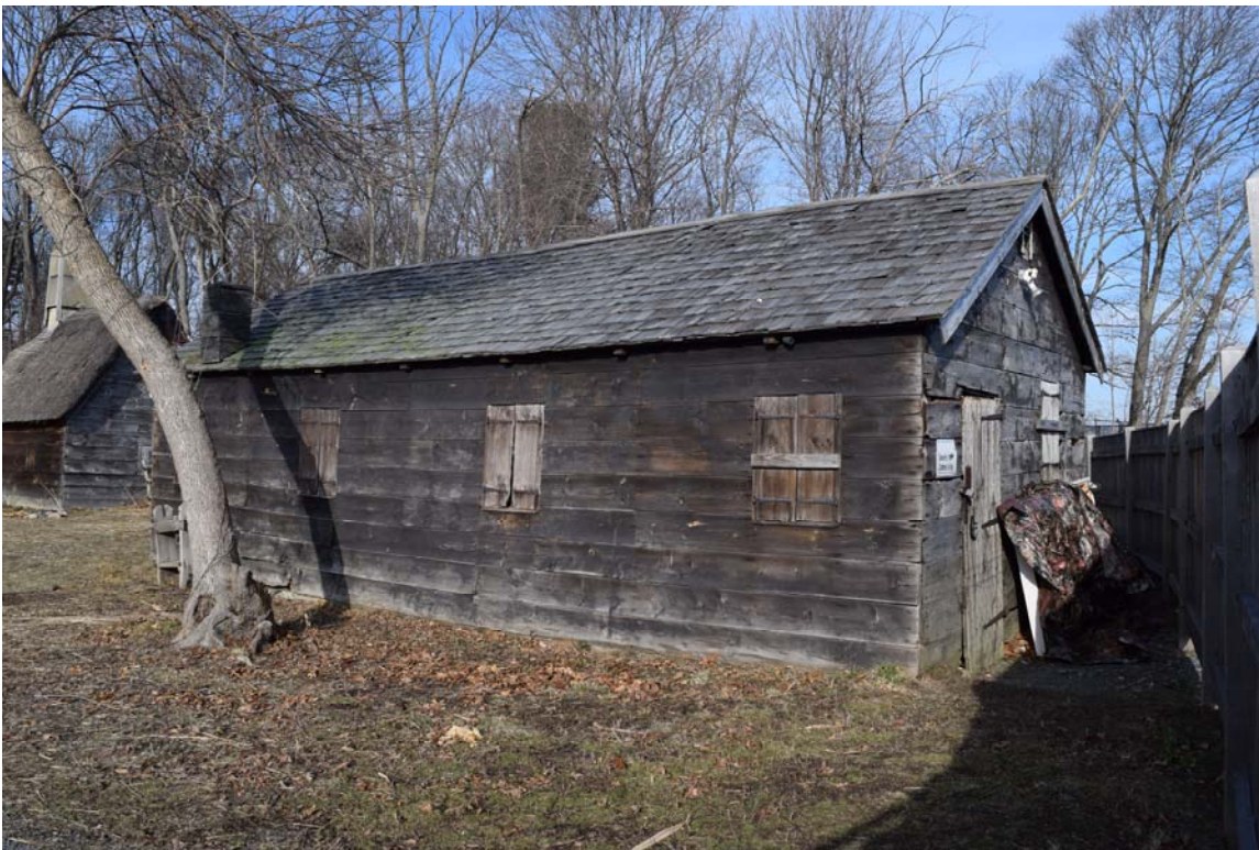
Photo 10. Visitor center, looking north.