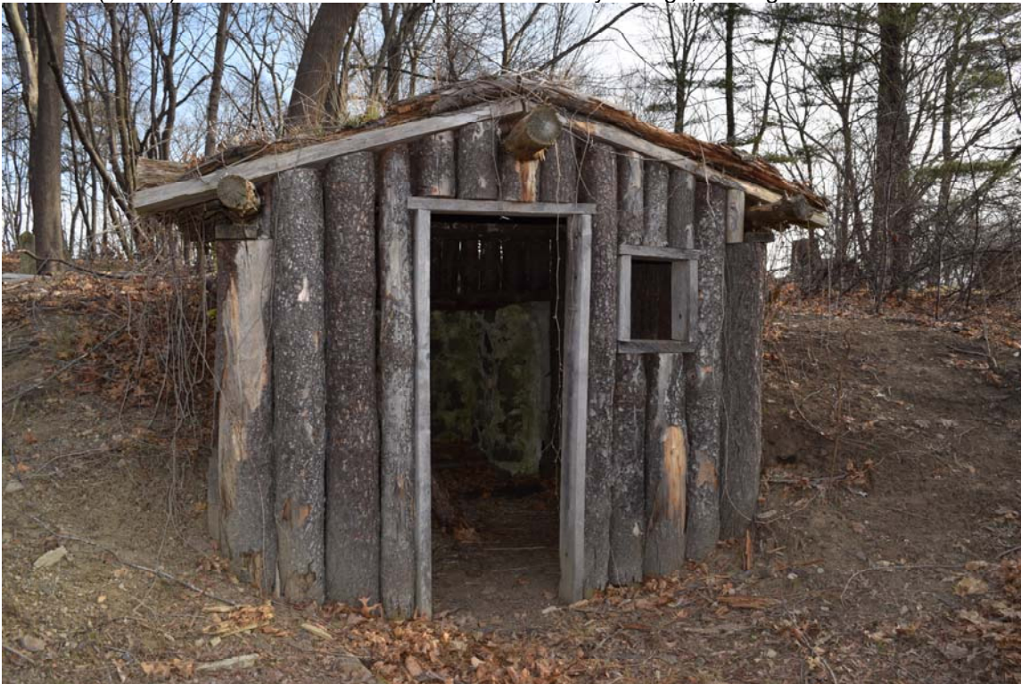
Photo 3. Dugout, looking east.