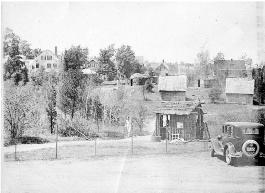
Figure 4. Ticket booth (not extant), cottages and English Wigwams, ca. 1935