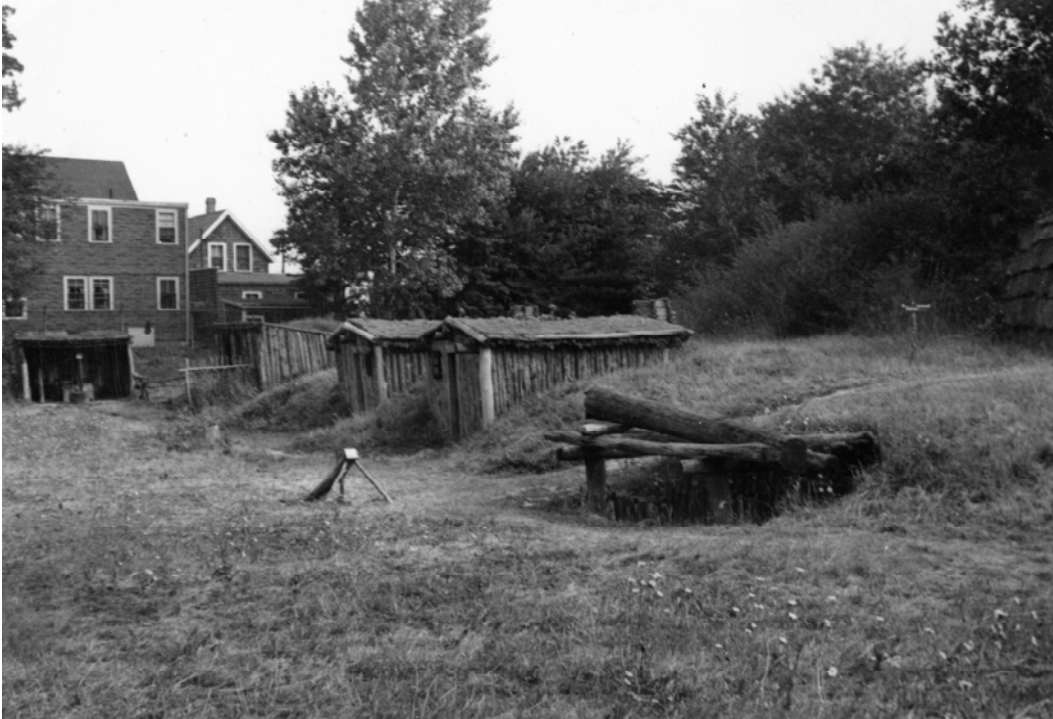
Figure 1. Dugouts and saw pit, ca. 1949 (Nelson Dionne Salem History Collection, Salem State University Archives and Special Collections, Salem, MA).