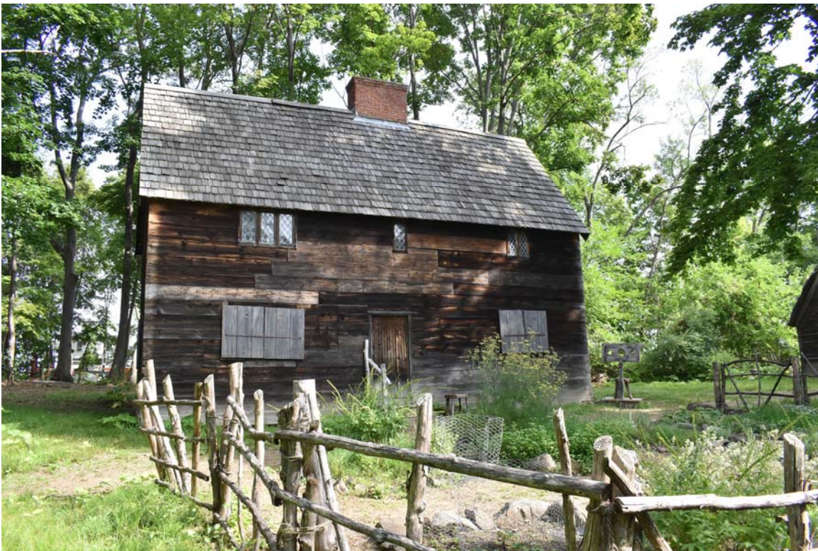
Photo 6. Governor's Fayre House, looking north.