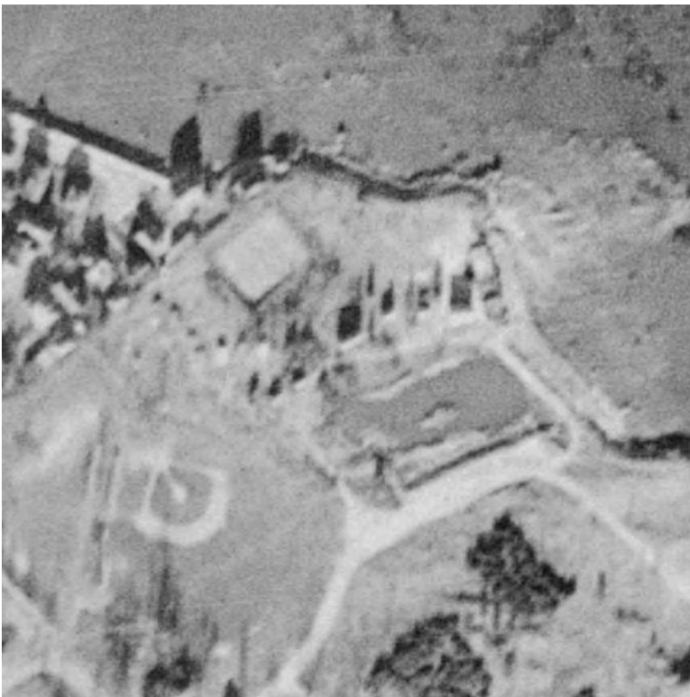
Figure 3. 1938 aerial image of Pioneer Village (NETR 1938).