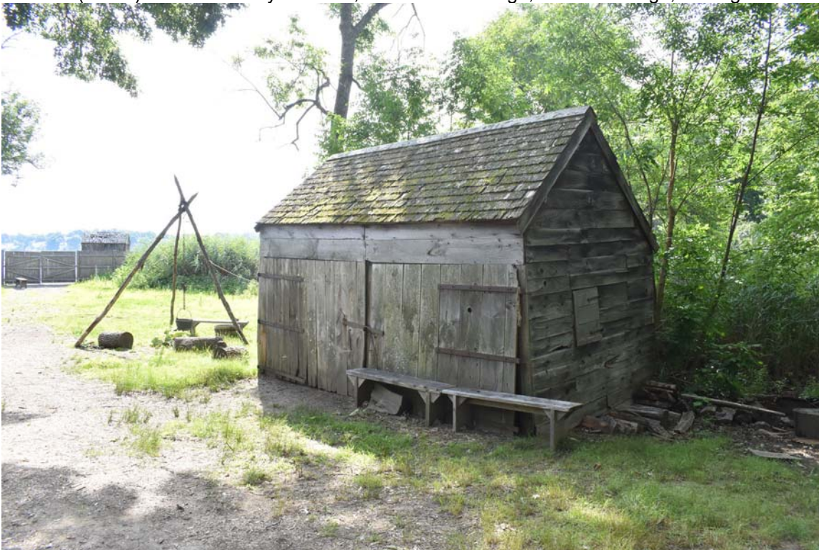
Photo 9. Blacksmith Shop, looking southeast.