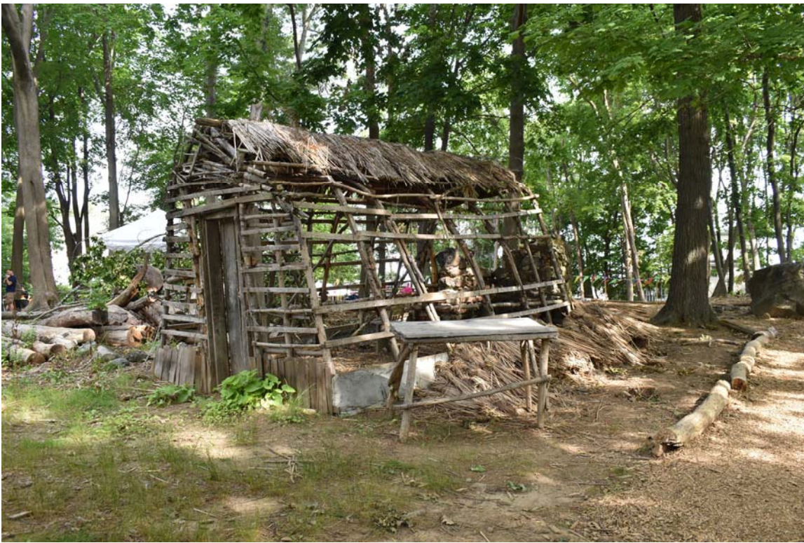
Photo 4. English Wigwam, looking northwest.