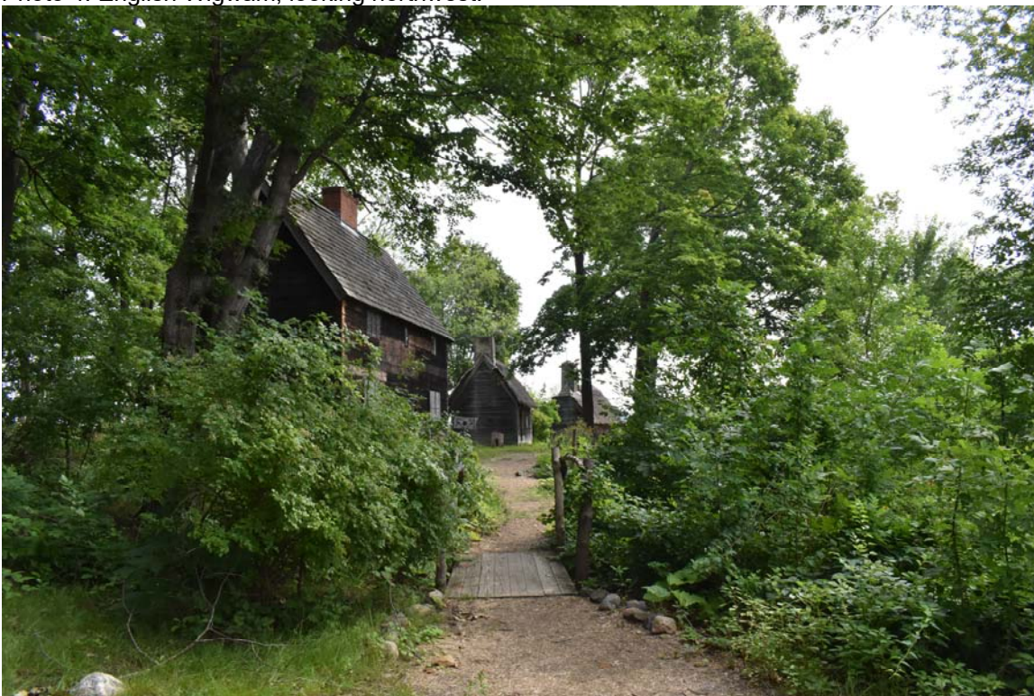
Photo 5. Governor's Fayre House and Blacksmith Cottage, looking east.