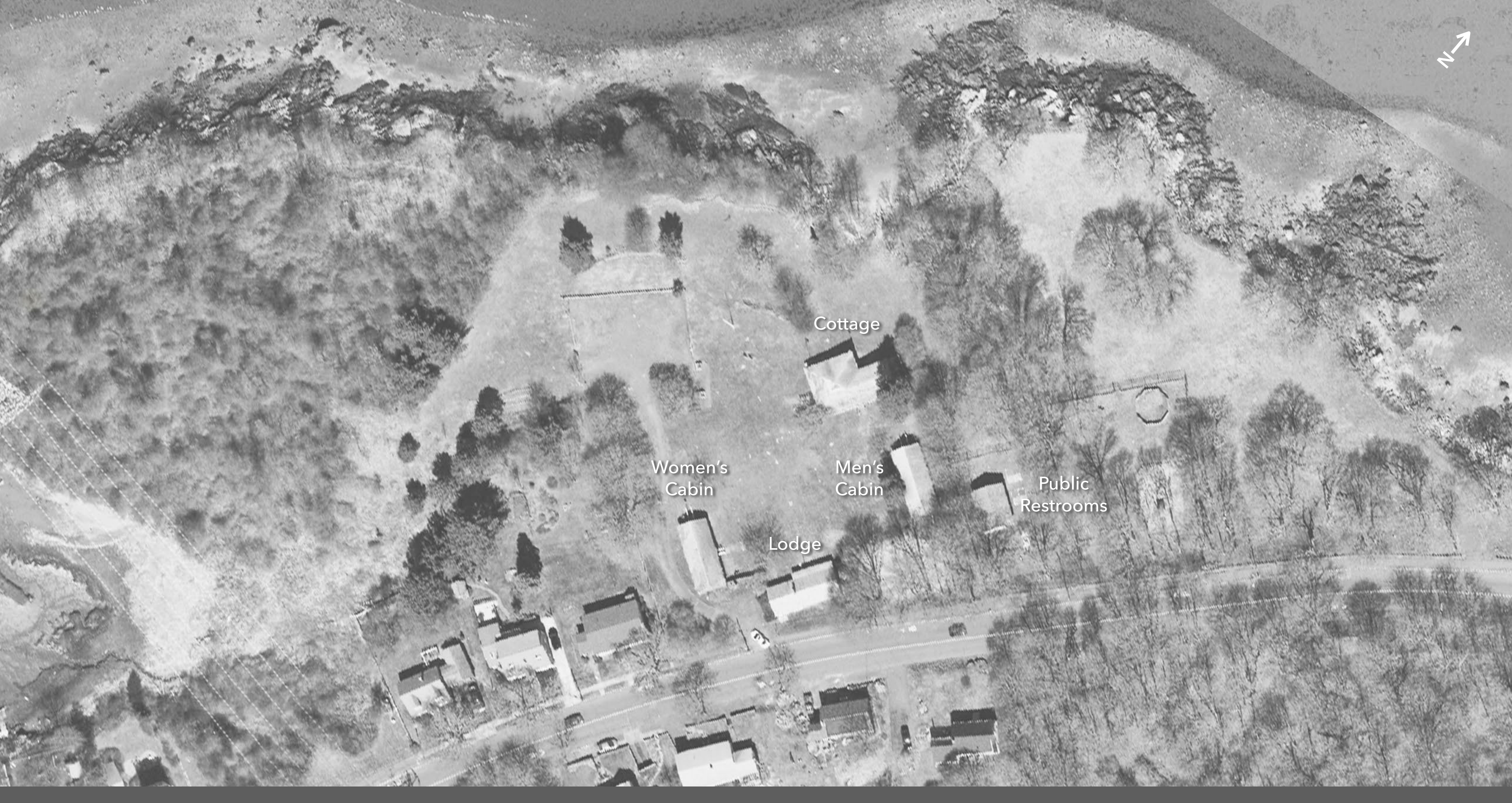
Existing Site Aerial