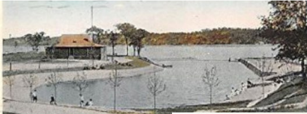
Original wooden bathhouse

Treasured by everyone, the Forest River Pool has been part of our community for generations, bringing us together for more than 120 years. But it didn't always look like it does now! Patrons swimming in the ocean water of the original "tide" pool occasionally felt fish brush against their legs.