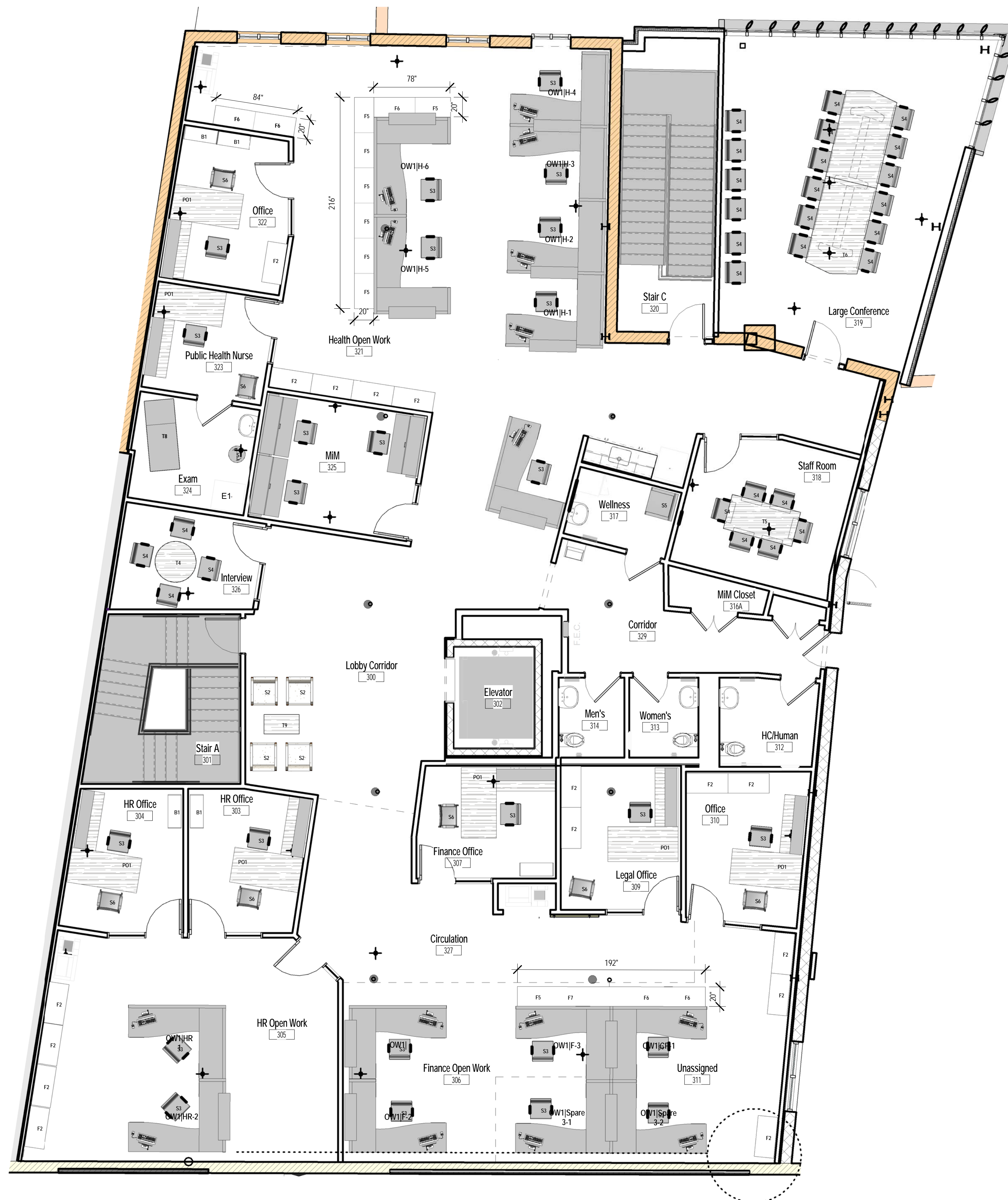
1 03 THIRD FLOOR PLAN - FURNITURE FURN-03 3/16" = 1'-0"