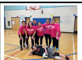
Congratulations to A-Team! Champions of our Women's Volleyball League 2021-2022.

Special thanks to the Salem Rotary Club for sponsoring this event.