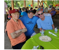
Fun times were had at our annual Senior Week BBQ

Registration for both classes is available at salemrec.com