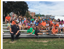
afternoon of fun! Special thanks to members of the SPD who came to play!

We had a great time at our Park Olympics last week. Children from Forest River Adventure Program, Mary Jane Lee and Furlong Playgrounds got together for an