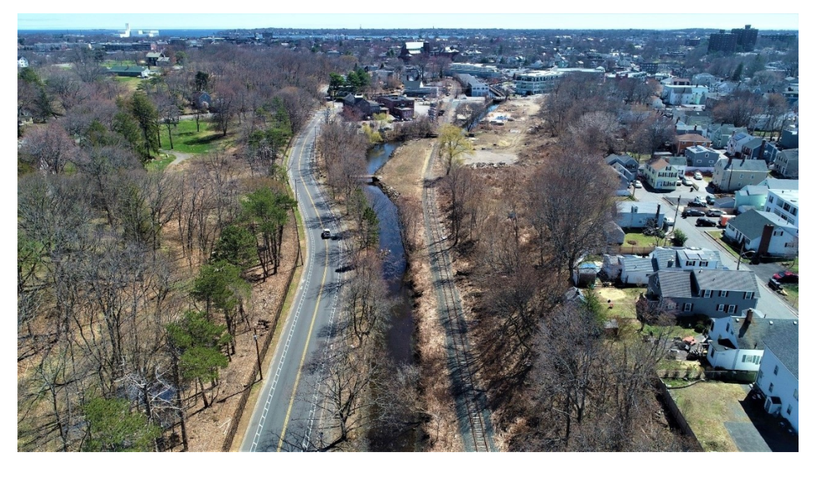
Thursday May 18th at 6:45nm | Zoom Meeting