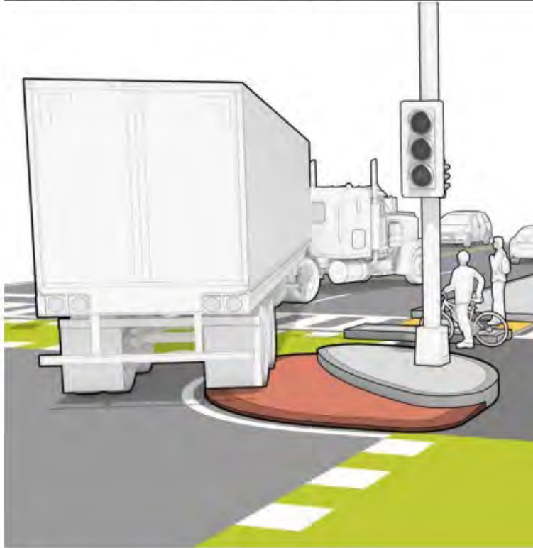
MassDOT Separated Bike Lane Planning & Design Guide