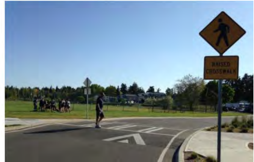
Salem Neighborhood Traffic Calming Program