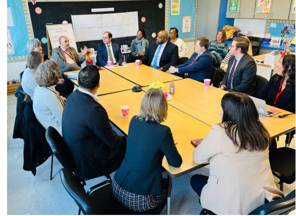
Salem's innovation holds the potential to serve as a model of what quality PreK expansion looks like in a Gateway city, with future considerations to sustain and expand Salem's innovative model within and beyond our community.